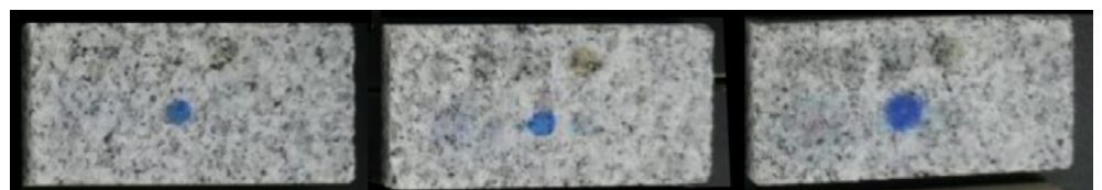
Figure 2: Granite treated with 3 mass% GMW-605, fluoro product A, fluoro product B